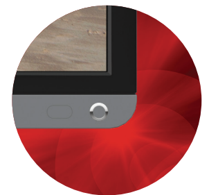
Modern Curved Corner Design with Gun Metal Finish and Sleek Frame Stand

Step up to the new large-screen Toshiba 40" L2400U slim LED Full HD television, with a modern gun metal design. Featuring an energy-efficient LED backlight and 1080p Full HD resolution, the L2400U offers great picture quality and value, perfect for the living room or master bedroom. With features like ClearScan® 120Hz technology that doubles the refresh rate for clearer fast-motion video and Dynamic Picture Mode that delivers maximum contrast, clarity and color saturation, you'll always get the most out of your sports and full-action movies. For gaming, Game Mode gives you that split-second reaction time, and DTS TruSurround™ creates an immersive sound experience.