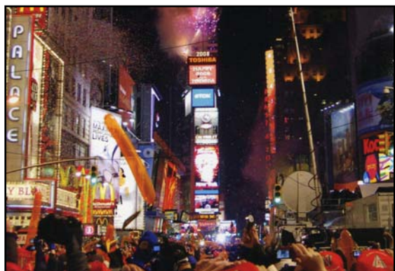
Photo of Old Screen as Seen on New Year's Eve

Toshiba International Corporation- Toshiba is in the process of installing its TRV2013GC 12.5 mm LED display screen in Times Square. The screen replaces the Discover® screen that was inherited when Toshiba purchased the advertising space. This new screen, called Toshiba Vision , will be used to market the Toshiba brand and products. A lighting ceremony will be held on Tuesday, July 15 at 7:00 p.m. at Chop Suey restaurant at the Renaissance New York Hotel, Times Square to commemorate the occasion.